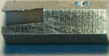
《 Conventional 》