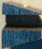
《 Conventional 》